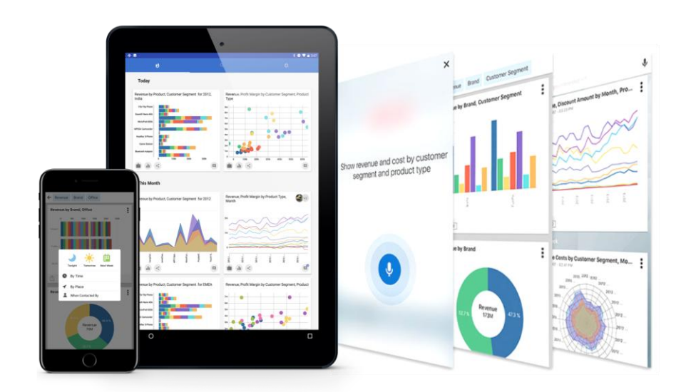
Figure 4. Contextual, voice-driven analytics in Oracle Day by Day.