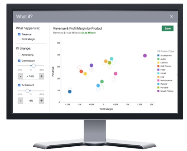
Figure 2. Sample OAC what-if analysis screen.

No other solution combines this array of capabilities to satisfy the needs of your entire organization, at any scale.