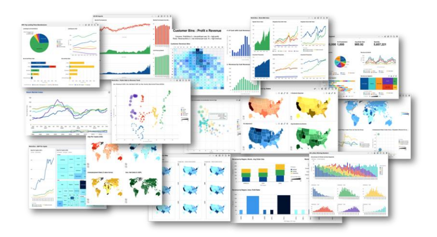
Figure 1. Visualizations in Oracle Analytics Cloud.

A complete, connected, and collaborative choice, Oracle Analytics Cloud makes it easy for you to capitalize on cloud analytics today and in the future.