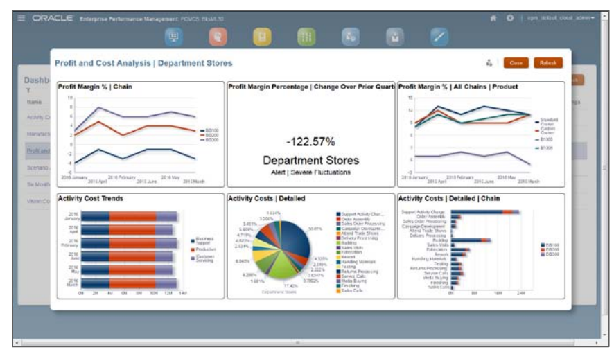
Figure 1. Configurable dashboards make it easy to quickly visualize profit & costs by key business dimensions.

Oracle Profitability and Cost Management Cloud provides actionable insight into allocation-based business processes by seamlessly combining data from the general ledger and other financial systems with data from operational systems. The solution provides the transparency needed to support analysis within today's complex enterprises.